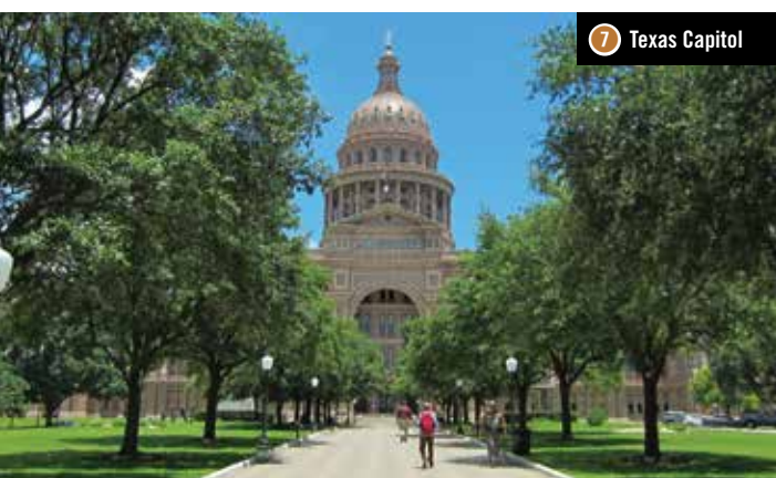
7 Texas Capitol

What's Out There Weekends dovetail with the Web-based What's Out There ( tclf.org/landscapes ), the nation's most comprehensive searchable database of historic designed landscapes. The database currently features more than 1,800 sites, 10,000 images, and 900 designer profiles. And What's Out There is optimized for smartphones and handheld devices, and includes What's Nearby —a GPS-enabled function that locates all landscapes in the database within a 25-mile radius of any given location.