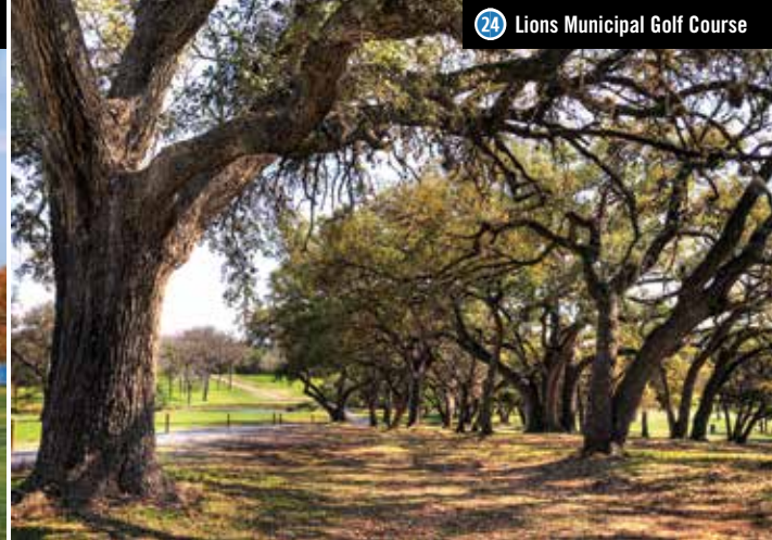
24 Lions Municipal Golf Course