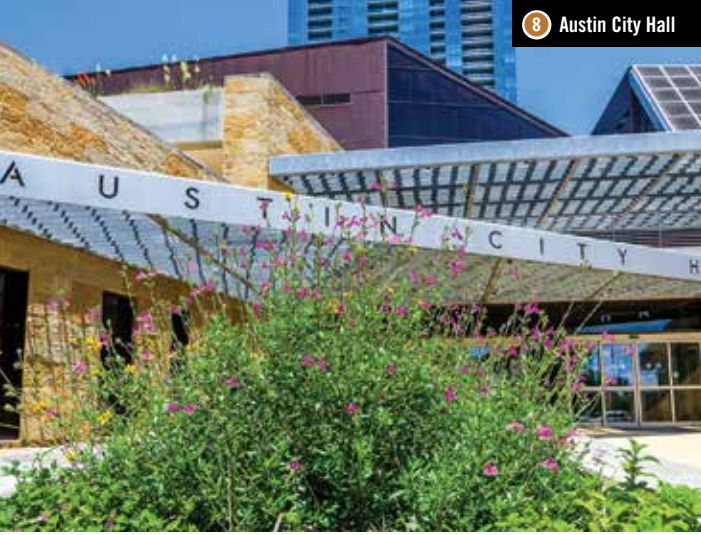
8 Austin City Hall