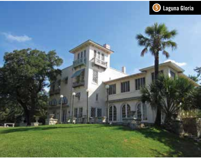
5 Laguna Gloria