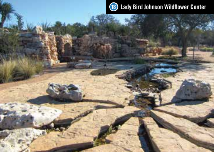
18 Lady Bird Johnson Wildflower Center